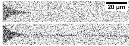
Figure 3. Magneto-optical images of a 750 nm-wide nanotrack, patterned in a film irradiated at a dose of 5 \times 10^{15} \text{ He}^+ \text{ cm}^{-2} , before (top), and after (bottom), the simultaneous application of a magnetic-field pulse ( \approx 190 \text{ Oe} , 1 \mu\text{s} ), and an electrical-current pulse ( \approx 3 \times 10^{11} \text{ A m}^{-2} , 500 \text{ ns} ). Dark and clear areas respectively correspond to areas of the sample which were magnetically reversed, or which are still in their initial magnetic state. The reversed domain appearing on the right in the lower picture either already existed (outside of the field-of-view) when the upper picture was taken, or was nucleated under the joint effects of field and current.

Following this procedure, a much greater track length was reversed (up to 45 \mu\text{m} , see left domain in figure 3) than with the same field pulse alone ( 10 \mu\text{m} , see figure 2), leading to an average track-reversal speed as high as 45 \text{ m s}^{-1} under less than 200 \text{ Oe} . For more intense current pulses (for example about 8 \times 10^{11} \text{ A m}^{-2} during 100 \text{ ns} ), the entire track (about 100 \mu\text{m} ) could even be reversed by one single field pulse. In these nanotracks, the only measurable effect of electrical current was demonstrated to be Joule heating, which totally hinders any possible spin-transfer effect [20]. Therefore, the higher reversal speed reported here is purely of thermomagnetic origin: Joule-heating during the current pulse (estimated to be about 20 \text{ K} for figure 3 [21]) thermally activates magnetic-field-induced domain nucleation and domain-wall propagation, which probably both contribute to the observed reversal [19]. This situation is very similar to the process involved in laser-assisted thermomagnetic recording [22, 23].