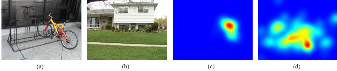
Fig. 1: The subjective evaluation of visual complexity is a difficult task. Is (a) more complex than (b)? This question may be partially answered by observing their corresponding attention maps (c) and (d).