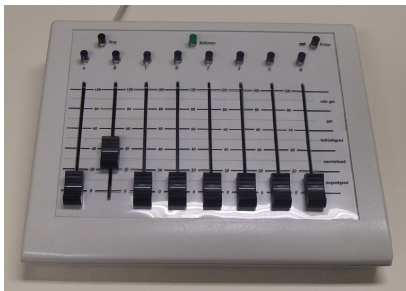
Fig. 1. Slider device used in the subjective experiment

A subjective experiment was setup that allowed the participants to evaluate the three parameters by using the slider device shown in Fig. 1. Only the first three sliders were used