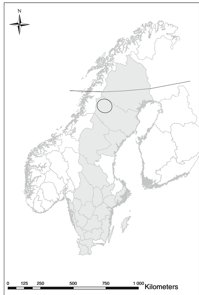
Fig. 1 Map of Fennoscandia with Sweden marked in gray. The study area is represented by the solid circle, representing a gradient from low alpine environments to inland boreal forest from west to east. The Arctic Circle is indicated by a line

We collected GPS location data from nine adult free-ranging female moose during March 6–11 in 2006. Moose ranged between the inland boreal forests to the low alpine areas in Northern Sweden with an average moose density of around 0.3 individuals per square kilometer, excluding the areas above tree line (Fig. 1). During winter, moose ranged in the inland forest (64°26' N, 19°22' E; WGS84) that is dominated by monocultures of Scots pine Pinus sylvestris covering a gently rolled landscape with an average elevation of 309 m±87 standard deviation (SD). Human density is moderate with an average of 6.0 humans per square kilometer and 1.0 km road per square kilometer (Statistics Sweden 2008; Swedish Land Survey 2008). With the start of the vegetation period, moose migrate to the low alpine area (65°42' N, 16°46' E; WGS84)