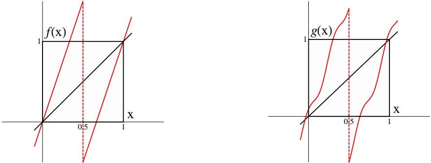
FIGURE 1. Left: Graph of the individual map f for a = 3 . Right: Graph of a small C^1 -perturbation of f .

as such, its topological entropy is equal to \log 2 . (For a definition and basic properties of the topological entropy in dynamical systems, see e.g. [17, 26].) In brief, the individual system is the most basic example of a simultaneously chaotic and robust system.