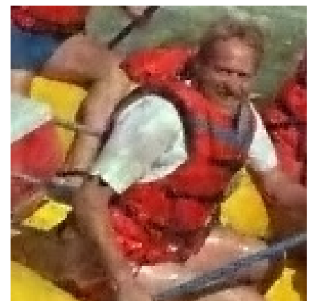
(c) reconstructed with SLTV, 27.03dB \mu = 0.32, \lambda = 1.3.