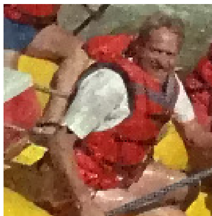
(b) reconstructed with TV, 26.83dB \mu = 0.42, \lambda = 0.06