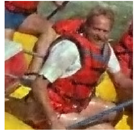
(c) reconstructed with SLTV, 27.03dB \mu = 0.32, \lambda = 1.3.