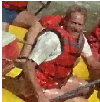
(b) reconstructed with TV, 26.83dB \mu = 0.42, \lambda = 0.06