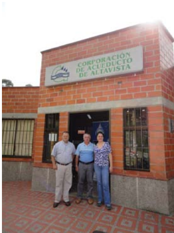
CORPORACION ALTAVISTA Medellin – Colombia