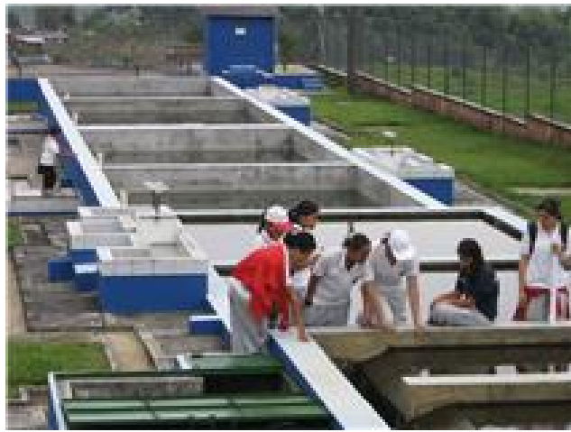
ACUEDUCTO MUNDO NUEVO Pereira - Colombia