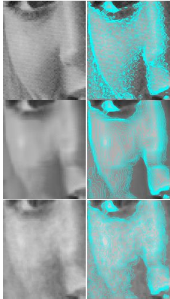
Figure 4: A close-up on the image Elaine of Figure 3. From top to bottom: Original, BM3D, and PDC-RS. Left: image alone; right: isolevel lines superimposed on the image.

Figure 5 clearly shows how the denoised images well preserve textures and edges, avoiding any cartoon effect for all the noise levels.