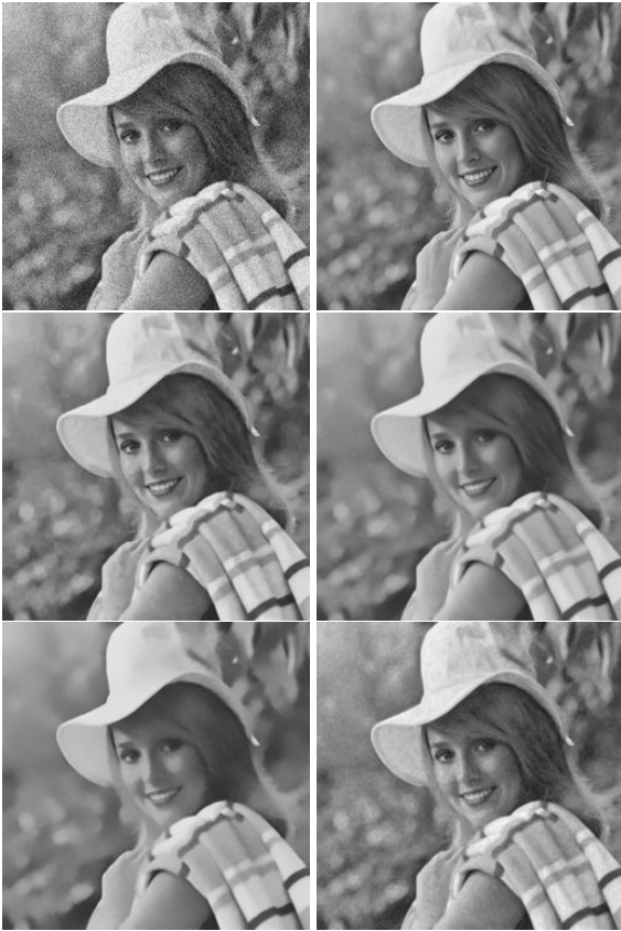
Figure 3: Visual comparison on the image Elaine for \sigma = 25 . In lexicographic order: Noisy, Original, BM3D, PCkNN, NL-means, and PDC-RS.

exhibit spurious patterns, thus leading to a denoised image with a very natural appearance. NL-means is clearly oversmoothed and BM3D presents many flattened regions in smoothly varying areas (see Fig. 4), giving a somewhat unnatural, cartoon effect to the denoised image. This is the major drawback of this algorithm for high noise levels that might be due to the thresholding in the wavelet domain. To illustrate the cartoon effect, Figure 4 shows a close-up on the image Elaine of Figure 3 and the corresponding isolevel lines. The orientation and density of these lines provide an indication on the direction and the norm of the gray level gradient. PDC-RS preserved very well the original isolevel line configuration while BM3D created a “patchwork” of flattened regions.