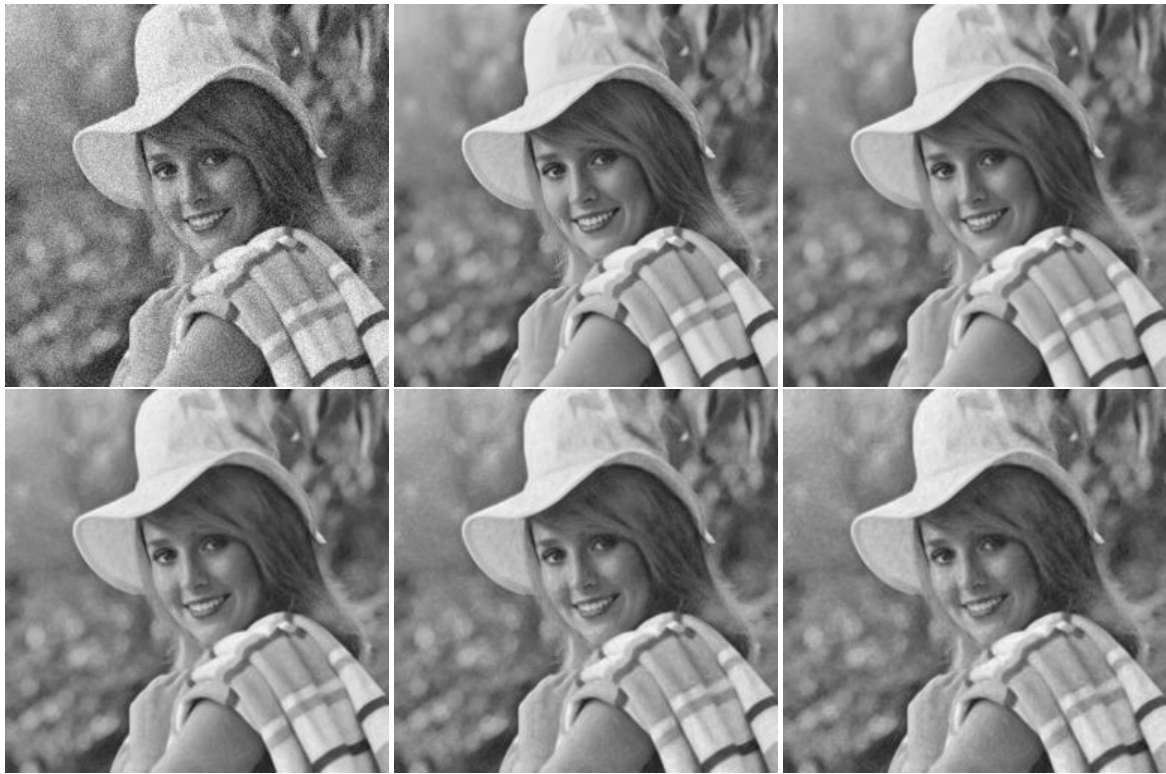
Figure 5: Denoising of the image Elaine using the proposed method, PDC-RS. The image was corrupted by an additive white Gaussian noise with successive standard deviations \sigma of 10, 15, 20, and 25. In lexicographic order: Noisy ( \sigma = 25 ), Original, denoised image for \sigma = 10, 15, 20 , and 25.