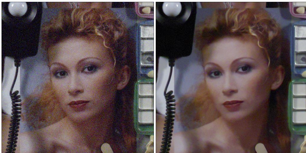
Figure 6: Professional benchmark image. RAW image (left) and denoised image (right).

hence correlates the noise. The result is a “structured noise” which is not Gaussian and not independent anymore. Removing this noise is a harder task since algorithms usually rely on a hypothesis of independence. Thus, we applied it to each color channel of the