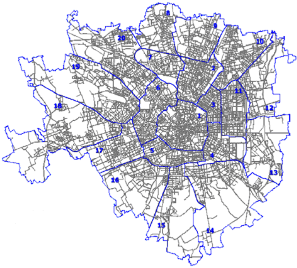
Figure 1. Administrative division of Milan into 20 districts.

1 2 3 4 5 6 7 8 9 10 11 12 13 14 15 16 17 18 19 20 21 22 23 24 25 26 27 28 29 30 31 32 33 34 35 36 37 38 39 40 41 42 43 44 45 46 47 48 49 50 51 52 53 54 55 56 57 58 59 60