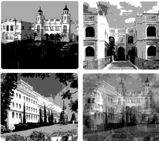
Fig. 2. The original images and observation image.