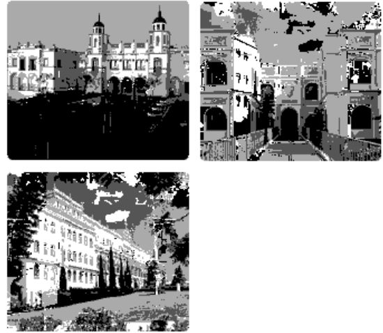
Fig. 3. Separated images using the algorithm from the observation image depicted in Fig. 2.