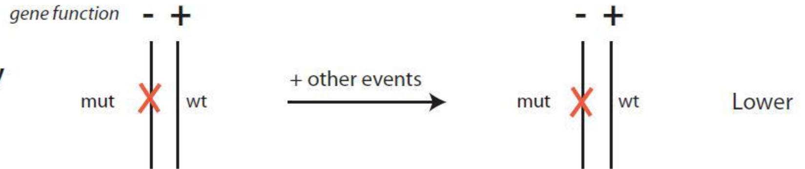
Figure 1. Different mechanisms of cancer predisposition resulting from germline mutations in tumor suppressor genes