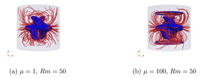
Figure 1: Magnetic lines and iso-value of the magnetic energy density corresponding to 25% of the maximum magnetic energy for two disks with different magnetic permeability \mu .

the decay time of the axisymmetric mode, especially the toroidal mode when permeability is high enough. It may thus appear as the dominant mode of the dynamo when the flow axisymmetry is broken, as it seems to be observed in the VKS experiment.