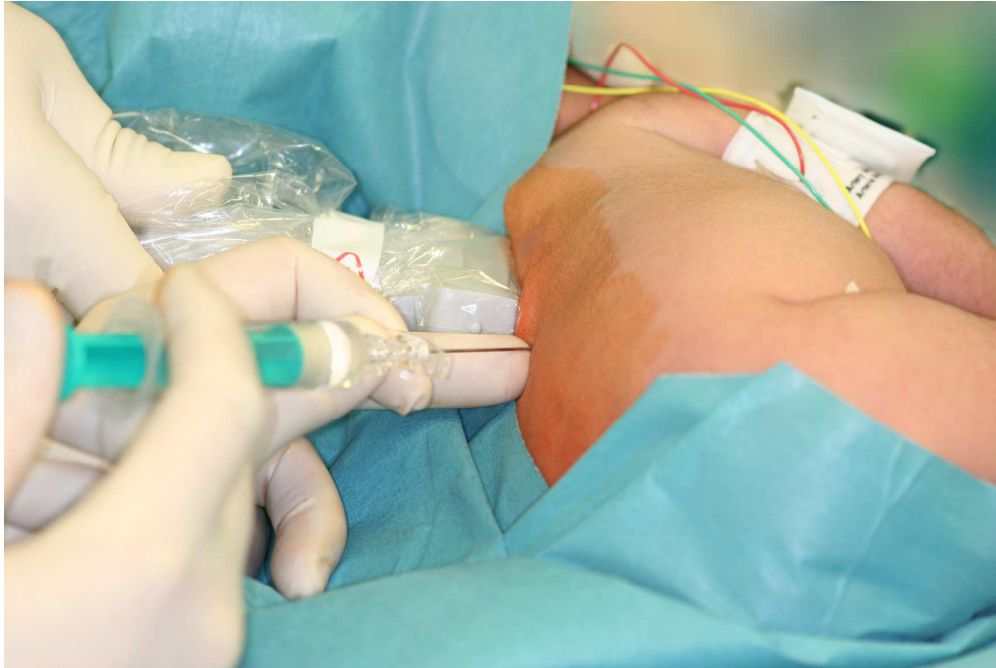
Position of the ultrasound probe relative to the Tuohy epidural needle 1236x824mm (72 x 72 DPI)