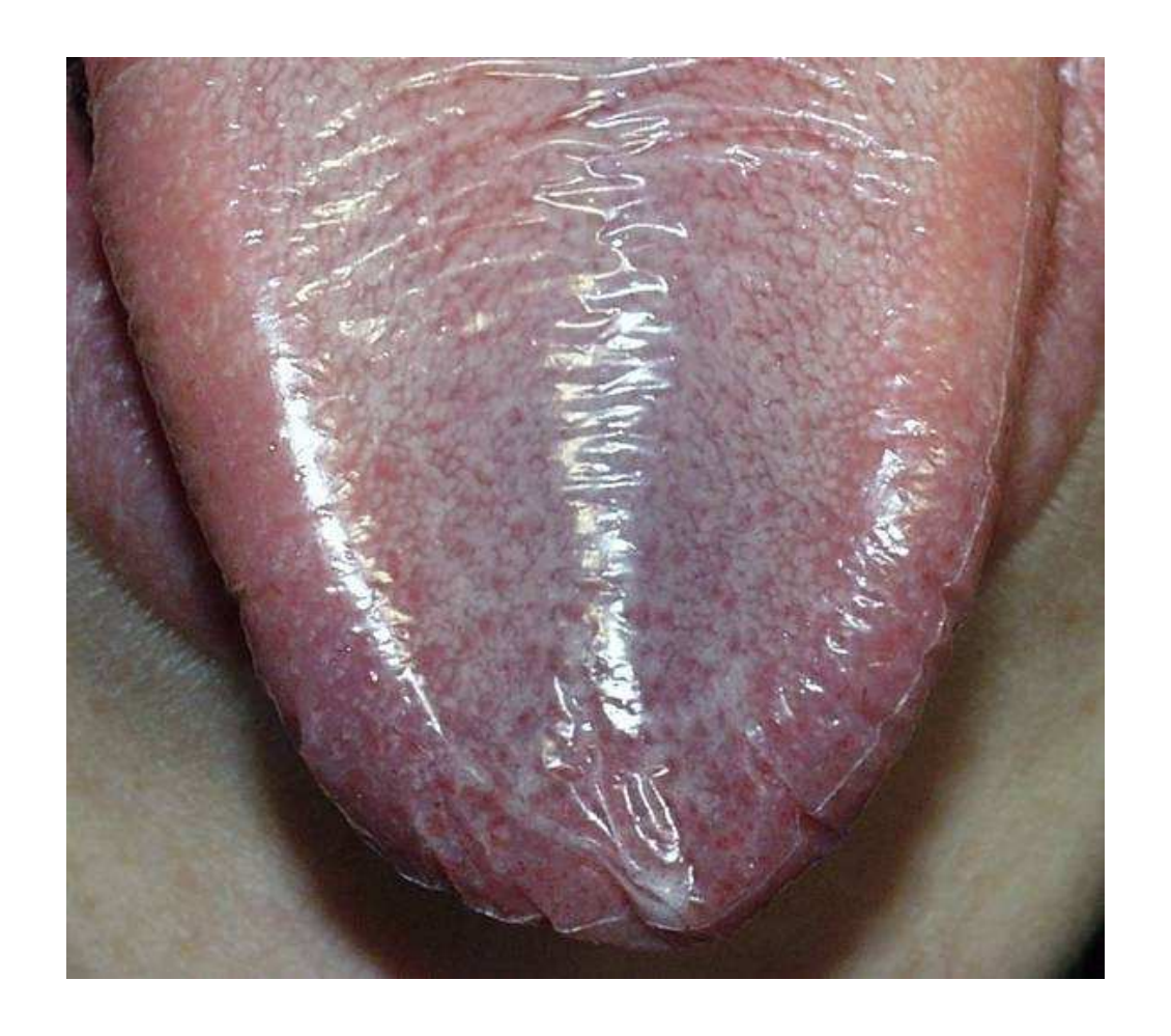
98x87mm (150 x 150 DPI)