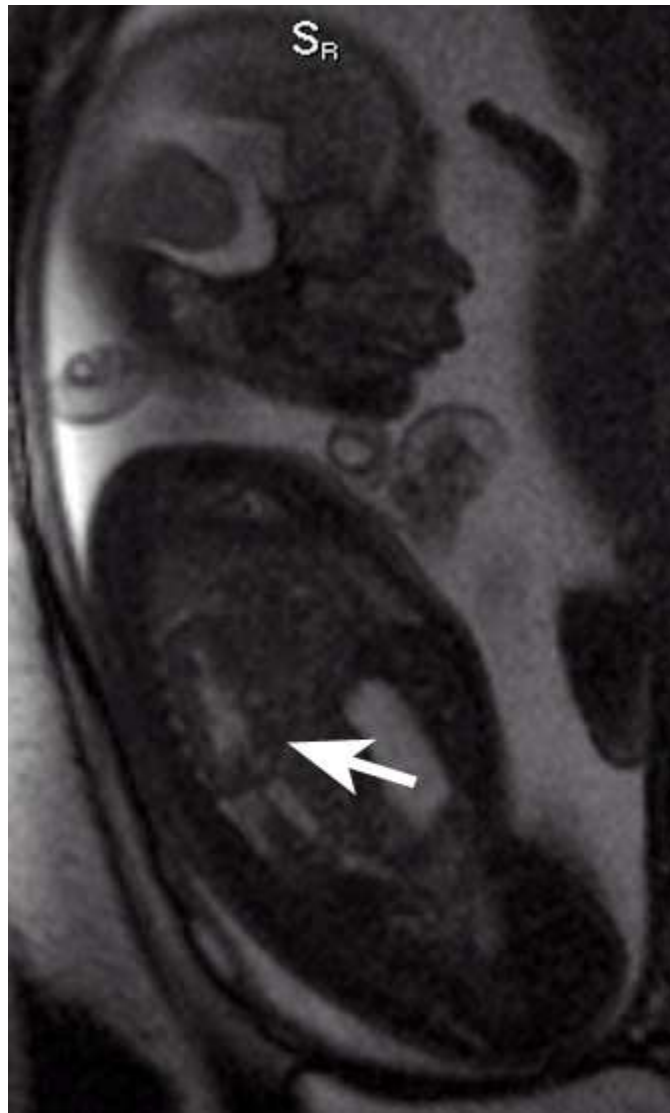
Figure 2 Sagittal section of the fetal thorax with Magnetic Resonance Imaging demonstrating the ectopic kidney (arrow) and the absence of CDH. 118x195mm (72 x 72 DPI)