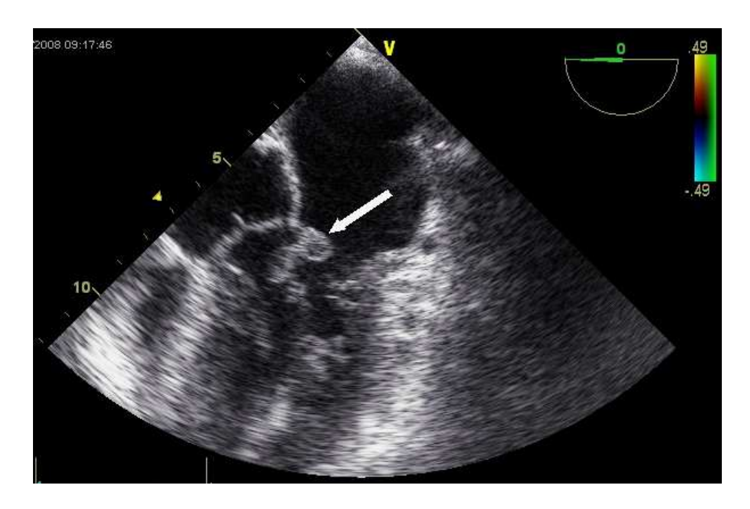
Figure 1 TEE showed a round (7x7 mm), mobile tumour attached to the atrial side of the anterior mitral leaflet (A1 scallop). Image is visible only in diastole, as a camber of the anterior leaflet (arrow). 160x106mm~(96~x~96~DPI)