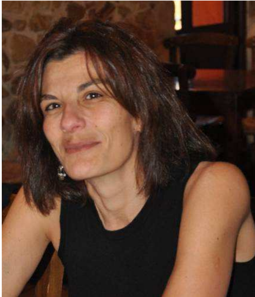
73x85mm (150 x 150 DPI)

1 2 3 4 5 6 7 8 9 10 11 12 13 14 15 16 17 18 19 20 21 22 23 24 25 26 27 28 29 30 31 32 33 34 35 36 37 38 39 40 41 42 43 44 45 46 47 48 49 50 51 52 53 54 55 56 57 58 59 60