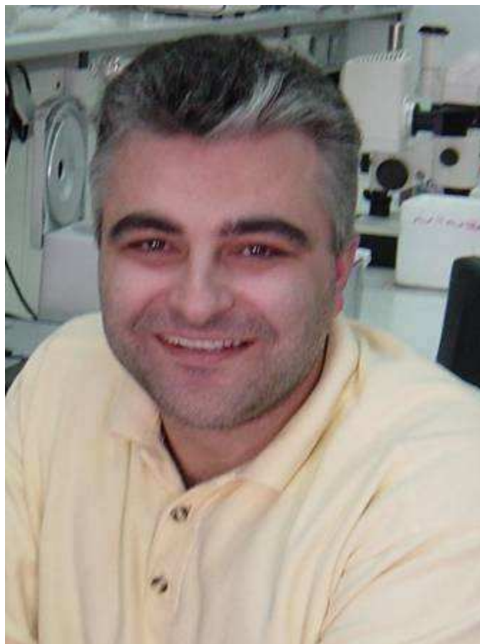
57x76mm (150 x 150 DPI)

1 2 3 4 5 6 7 8 9 10 11 12 13 14 15 16 17 18 19 20 21 22 23 24 25 26 27 28 29 30 31 32 33 34 35 36 37 38 39 40 41 42 43 44 45 46 47 48 49 50 51 52 53 54 55 56 57 58 59 60