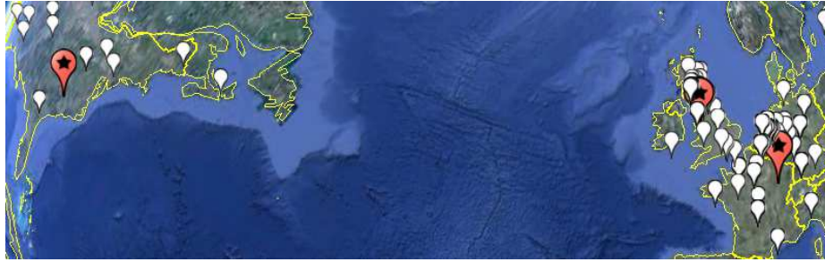
Fig. 3. Distribution of places in documents judged relevant for topic 10.2452/ GC – 010. Cluster centroids indicated with star-shaped markers. Data mostly reflect the geographic footprint of the query.

better results in all measures than the baseline, indicating that a theoretical improvement is possible; however, the tested fusion methods are not able to capture this potential. The error analysis showed that apriori diversification of the query was useful when the geographical data are sparse, and therefore it is necessary to “drive” the query towards possible relevant results. If the geographical data in the relevant documents are dense enough to support the diversification of results, then diversity can be inferred from data and query reformulation adds noise.