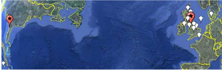
Fig. 2. Distribution of places in documents judged relevant for topic 10.2452/ GC –006. Cluster centroids indicated with star-shaped markers. Data are sparse and do not reflect the geographic footprint of the query.