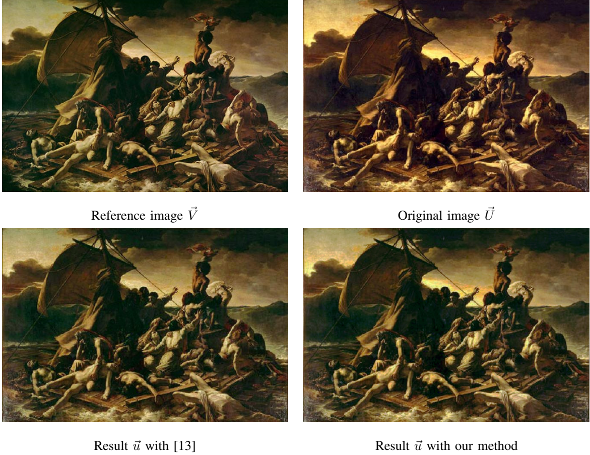
Fig. 1. Comparison between our method and the one of [13] for the painting of Géricault: The Raft of the Medusa.