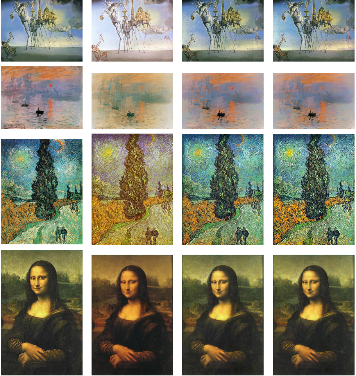
Reference image \vec{V}