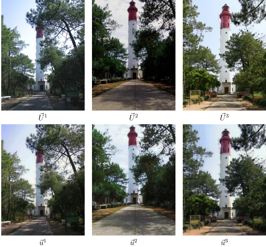
Fig. 3. Lighthouse sequence. First line: Original images. Second line: Final images.