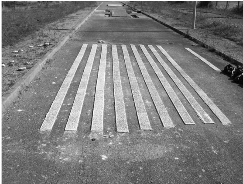
Figure 1. Testing site for the cracking strips.

The cracking tests were decisive in selecting the type and dosage of fibres. Two campaigns of in-situ cracking tests were carried out, where 6-m long, 14-cm wide strips were laid in parallel on an old asphalt pavement (see Fig. 1). After some months, it was tentatively concluded that either 3 % of steel fibres or 4 % of PVA fibres could equally well prevent cracking. The latter solution was preferred, owing to better workability and lower cost induced by these synthetic fibres. A large, 20x2 m test pad was cast, in order to check that no cracking would appear at full scale. Unfortunately, after a hot early summer, it was found that PVA fibres tended to soften; this reinforcement was then no longer able to overcome the crack development in the strips, unlike steel fibres. Consequently, the final solution recommended by the authors is to use at least 3% of steel fibres to eliminate any visible cracking. This finding is also confirmed by a series of laboratory cracking tests performed on the mortar phase.