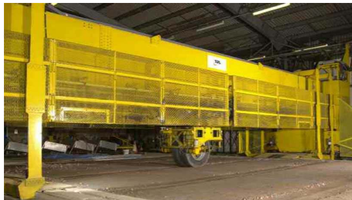
Figure 3. The TRL Pavement Testing Facility (Crowthorne, UK)

Finally, a key performance test was carried out with the TRL Pavement Testing Facility (TRL, see Fig. 3) including an equivalent of 1.0 M standard axles at 20°C, followed by 0.5 M standard axles at 35°C. This structural test could help in evaluating a pavement structure with various wearing courses, even if the number of loading cycles remained small with regard to the expected traffic for a long-life pavement.