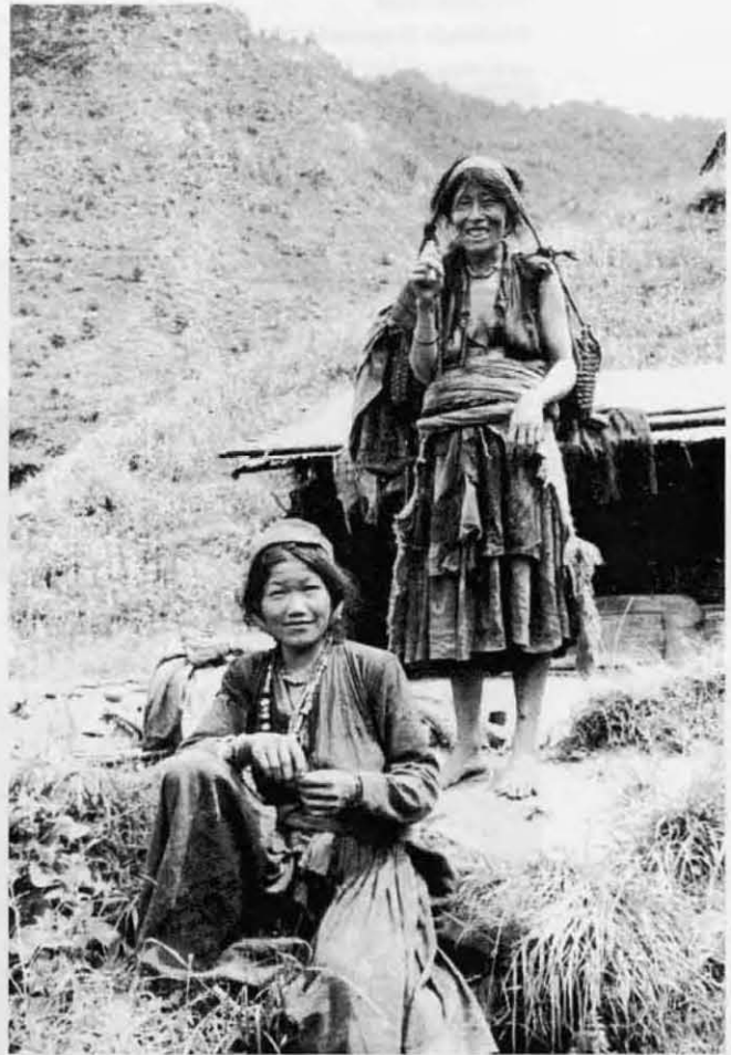
Women of Langtang, Wangel village, 1965.