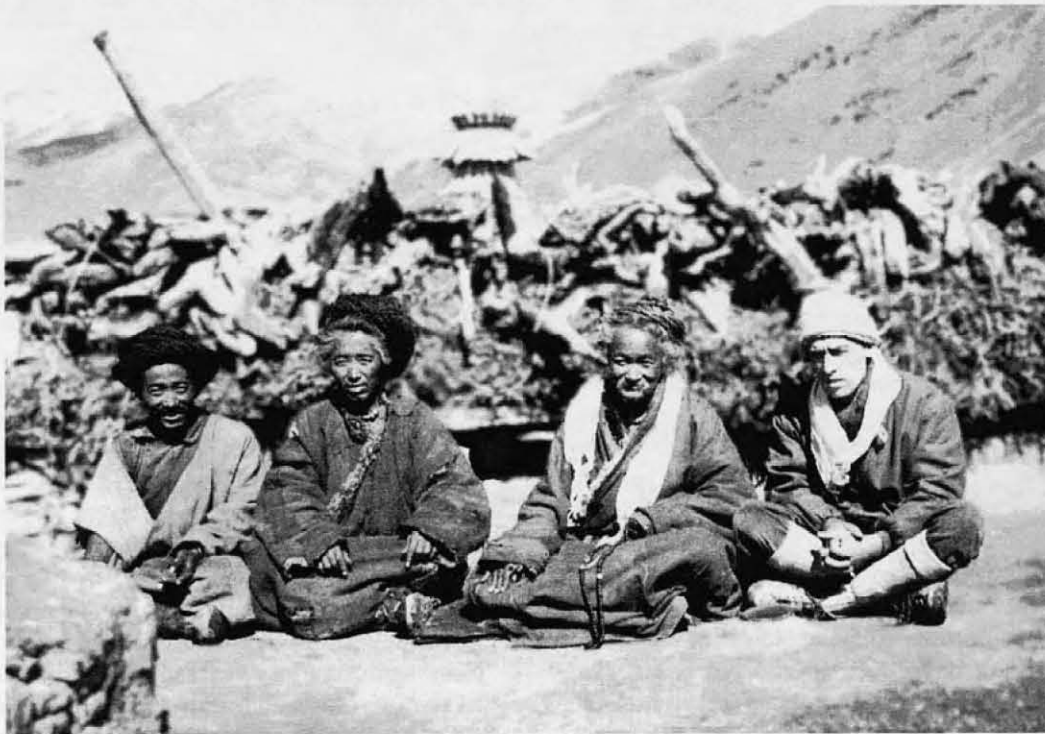
Ethnologist and lamas, Kegar, Dolpo, 1965.