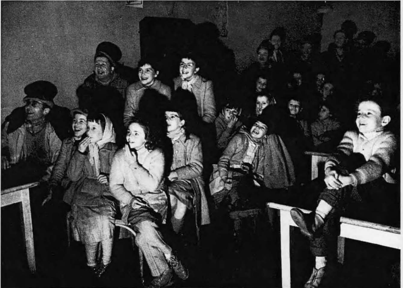
This photograph is a homage from Jean-Dominique Lajoux, CNRS, who worked for many years in collaboration with Corneille Jest, both in France (Aveyron) and in the Himalayas. It shows the villagers of Bouloc watching themselves in a film projected in the local school during winter 1960-61. The film was made by J.-D. Lajoux and C. Jest in summer 1959. It depicts village life and local techniques. This photograph from J.-D. Lajoux is the result of an experiment using an infrared flash.