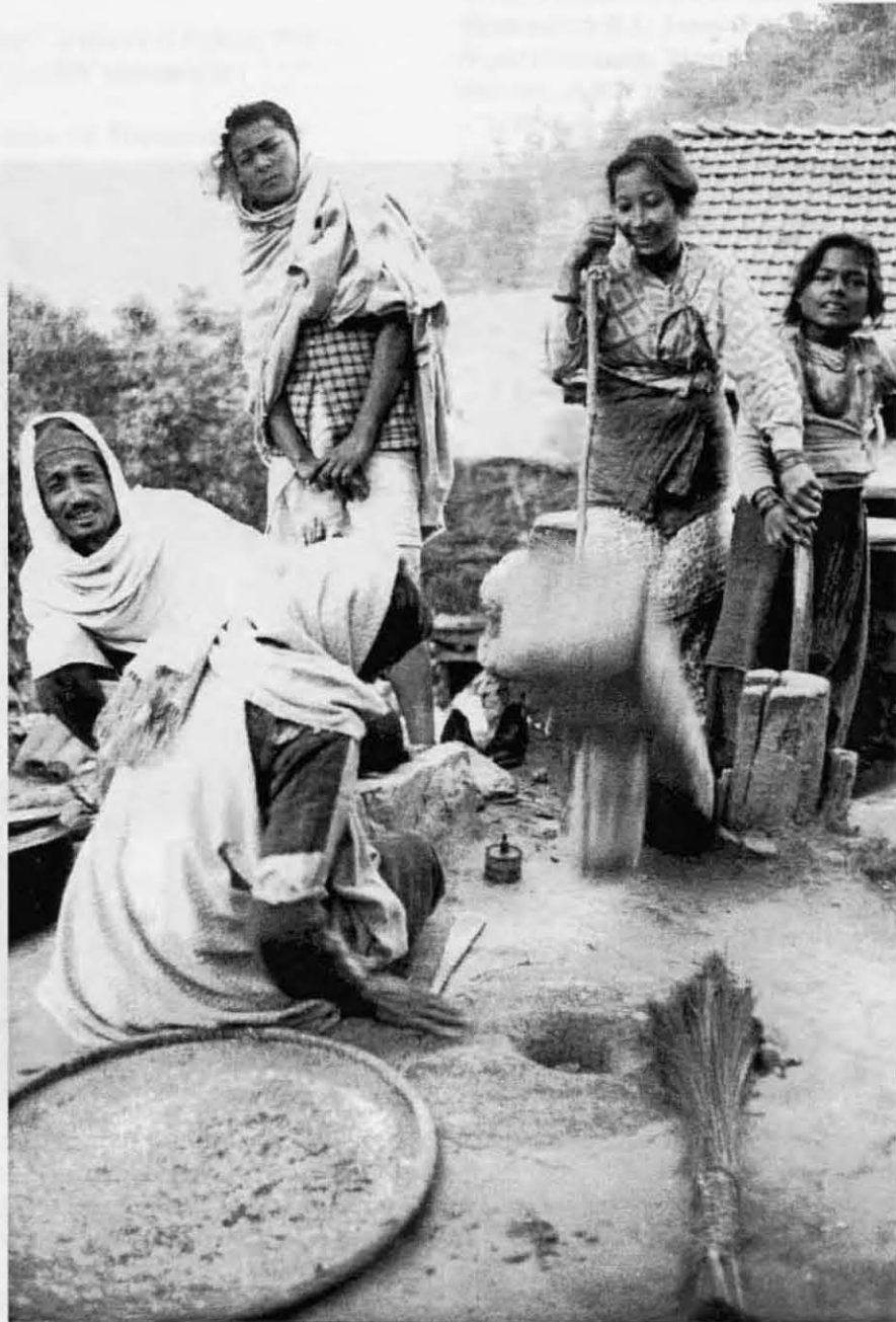
Brahmans pounding rice. Trisuli Valley.