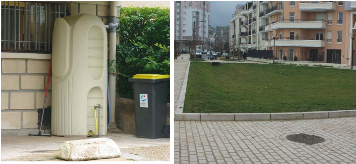
Figure 1 – Two examples of BMPs in France: a rainwater harvesting tank at the parcel scale in Champigny (Val-de-Marne), and an infiltration/overflow basin for a block of houses in Noisy-Le-Grand (Seine-St-Denis)

Moreover, most of the applications of source control techniques are still confined to small experimental areas. In a scenario of large diffusion of source control, does it have to replace completely traditional systems, or just to be complementary to them? To what extent? In which cases? At which scale it has to be managed?