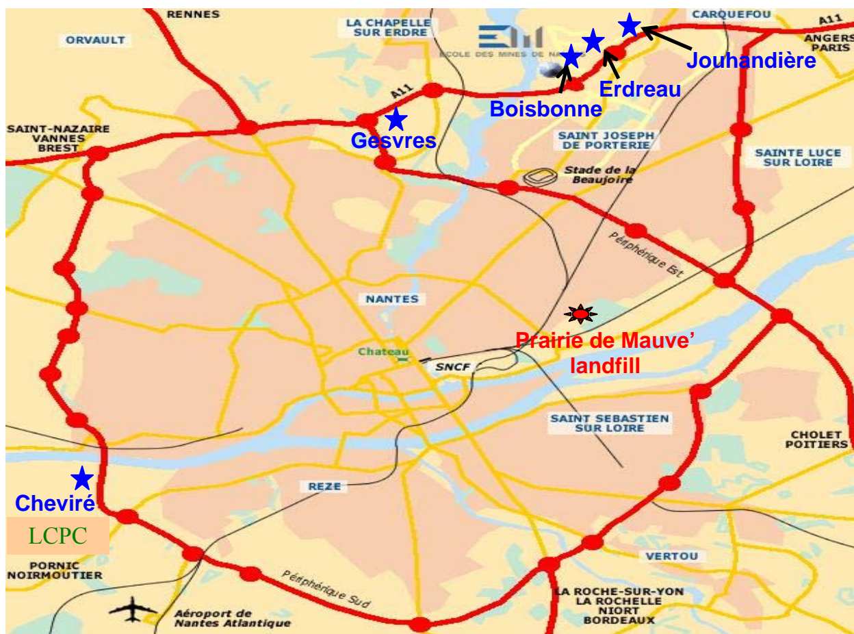
Figure 3: Location of the five infiltration basins and the landfill in Nantes area

retention-infiltration basins receiving highway runoff waters were selected and a preliminary sampling campaign was performed in December 2008 and January 2009 to collect surface water and sediments from a central zone of the basins: along A11 highway (four basins) and next to Nantes ring-road (Cheviré basin) (Figure 3). This last basin has been studied by LCPC since 1991.