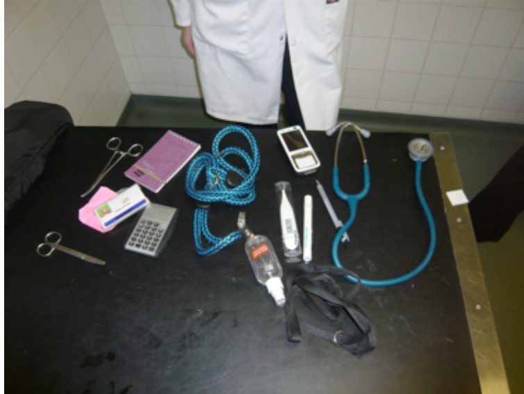
Figure 4: The mobile phone is one of a number to learning and work aids used by students