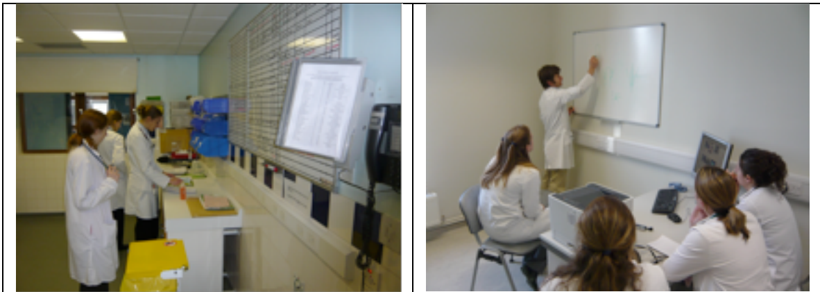
Figure 5: The mobile phone augments technologies already in uses