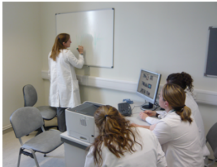
Figure 3: A consultation room at the Royal Veterinary College