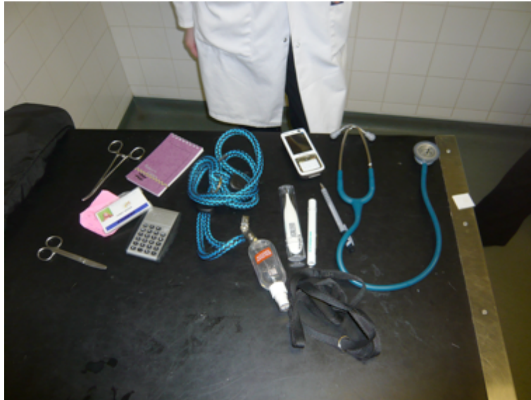
Figure 4: The mobile phone is one of a number to learning and work aids used by students