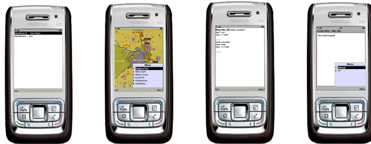
Figure 2 – Mobile application: (a) services menu, (b) map and options (c) checkpoint information and (d) upload screen.

needed. In this case a fixed map image is located in the Application Layer server and will be transformed according to the mobile characteristics that came in the requests from the mobile device. As far as the In/Out modules are concerned, the simplification of the platform and the adaptation to a specific case has as consequence the removal of architectural generalizations. In the case study the implementation of the mobile device makes 4 requests to the application layer (Figure 2): (1) map request; (2) checkpoint position request; (3) checkpoint information request; and (4) request to send new information about a checkpoint.