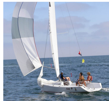
FIG. 1 – Universal flow distribution and flying sail, where wrinkle generation is visible

From a structural point of view sail are constituted by thin orthotropic laminates, which are assumed in large displacements-small strains regime. Some buckling related phenomena are encountered, called ‘wrinkling’. This determines the formation of oscillations and wrinkles onto the fabric surface, where local uni-axial stress concentrations are encountered, as in Fig.1-b. Such phenomena can modify stress distributions, with dramatic impact on the whole deformed shape. One important aspect of sail analysis is then unsteadiness, which can be driven by a composition of fluid unsteadiness (such vortex shedding) and unsteadiness induced by the boat’s motions in seaway.