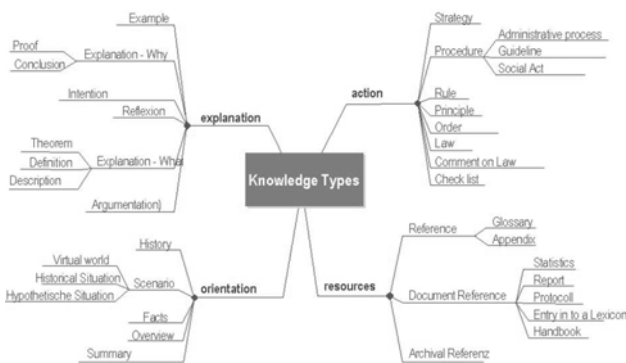
Figure 2: Ontology, Source [14]

As shown in tables 1 and 2, some parts of the Learning Object and the Item metadata are similar. Receptive knowledge points can be categorized using a didactical ontology as defined in [14] (figure 2):