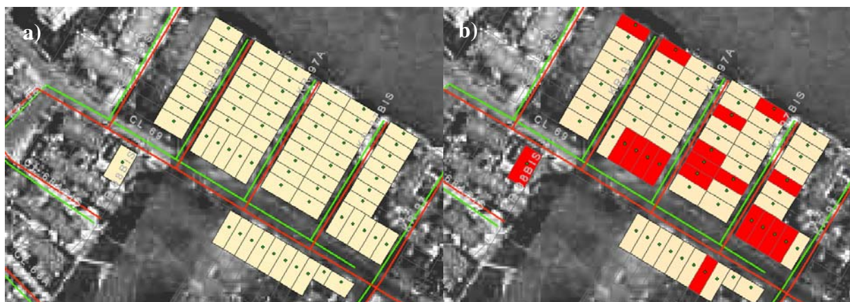
Figure 1: (a) 69 properties in which dye experiments and CCTV inspections were performed (b) 19 of 69 properties with presence of wrong connections (Mestra, 2008)