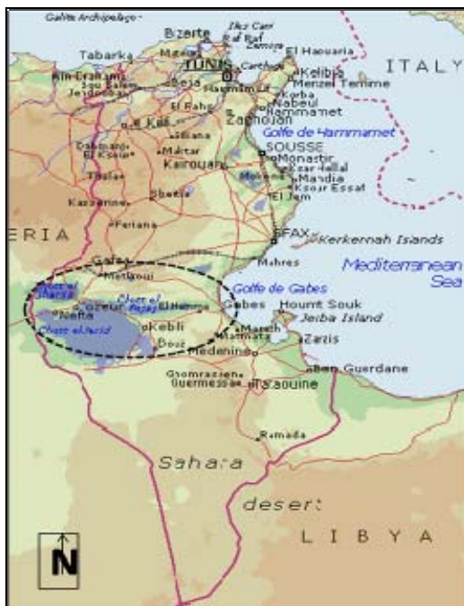
Figure1: Localization of southern Tunisia oases (Adapted from Prinz and Loeper, 2008)

Whereas the underground water resources are sustaining a chronic overexploitation, major of the existing oases in southern Tunisia observed their area duplicating. The urbanization of such ecosystems modified also considerably the local inhabitant's behavior towards water management. The implementation of drinking water networks facilitated the access to water and sewage disposal networks have been developed as well as the waste water treatment station that flourished around the oases.