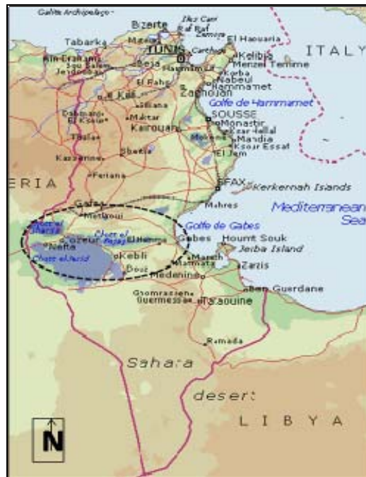
Figure1: Localization of southern Tunisia oases (Adapted from Prinz and Loeper, 2008)

Whereas the underground water resources are sustaining a chronic overexploitation, major of the existing oases in southern Tunisia observed their area duplicating. The urbanization of such ecosystems modified also considerably the local inhabitant's behavior towards water management. The implementation of drinking water networks facilitated the access to water and sewage disposal networks have been developed as well as the waste water treatment station that flourished around the oases.