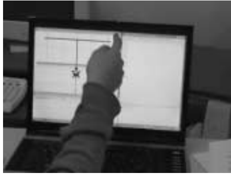
Fig. 2. Showing at the screen using a display frame of reference.