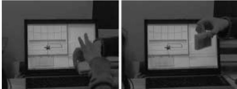
Fig. 4. Using a concrete 3d object to help them foresee the changes of planes of the parallelogram in the screen.

of the initial position of turtle in 3d space, children didn't use only their bodies or their hands but also concrete 3d objects, in our case a cassette that they moved in 3d space.