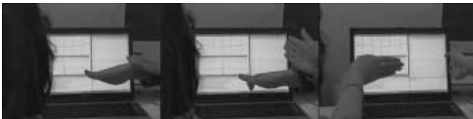
Fig. 3. Using hands so as to project an ego-frame to the vehicle-frame of reference.

It could be also said that in order to visualise turtle's motion and find concrete analogues in real space children used two perspectives: an intrinsic- internal one and an external one. An intrinsic-internal one was used in cases that children were trying to co-ordinate their ego-frame with the vehicle frame and thus to view the surrounding environment from inside, as the space immediately surrounding them, while trying to conceptualise it in three dimensions constructed out of the axes of their body (Tversky, 2005). In these cases they used their hands and bodies in order to concretize turtle's motion. However when they were manipulating the figures created by the turtle they adopted an external view, they viewed those objects from outside and they sometimes needed concrete 3d objects, as transitional ones between real space and simulated 3d space. In fact, in order to visualise the change of planes of a parallelogram as a result of the change