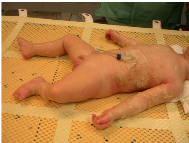
Fig. 6 Day five: Suprathel® peels away and can be easily removed with any emollient

severe blistering skin diseases are better managed in burns units. Burns units have a number of specialised facilities and a team trained in dealing with all aspects of major burns [7]. Core temperature and room temperature need to be monitored carefully, as thermal dysregulation is common; even though the patient is febrile, peripheral vasodilatation adds to loss of heat and may cause a drop in the core temperature. Despite the burn-like appearance of SSSS, massive fluid resuscitation is not required since the massive burn oedema, which develops after thermal injury, does not appear in SSSS. Pain management and local skin care represent the major challenges in SSSS. The choice of analgesia must be based on the needs of the patient and opiates are preferred. Selecting the proper wound dressing helps to alleviate pain remarkably—but skin care in generalised SSSS is the most divergently discussed topic. Lowney et al. [8] recommend general measures: “the skin must be treated gently and kept clean.” Margileth [9] states: