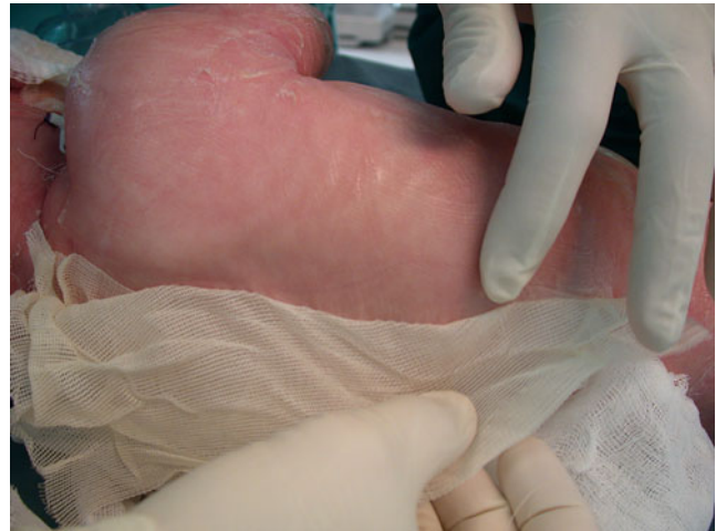
Fig. 4 Wound check on the second day: Suprathel® became transparent and adheres well to the wounds

Since the aetiology of SSSS has been known and antibiotics have been available, systemic antibiotic therapy has become a standard treatment. In severe cases, intravenous therapy with anti-staphylococcal antibiotics is required. In patients with initial therapeutic failure using conventional antibiotics, one should not forget the possibility of methicillin-resistant S. aureus (MRSA) involvement. Topical antibiotics in generalised SSSS are often not effective, since the focus of infection is usually not known and often distant from the site of blistering. They should also be avoided due to unpredictable absorption through denuded skin. Silver sulfadiazine, which is still used in some burns units, is not recommended for SSSS because of enhanced systemic absorption through denuded skin [5]. Steroids are contraindicated on the basis of both experimental and clinical evidence [6]. In addition to the antibiotic management strategy, about which there is no controversy, there is a vast consensus that patients with