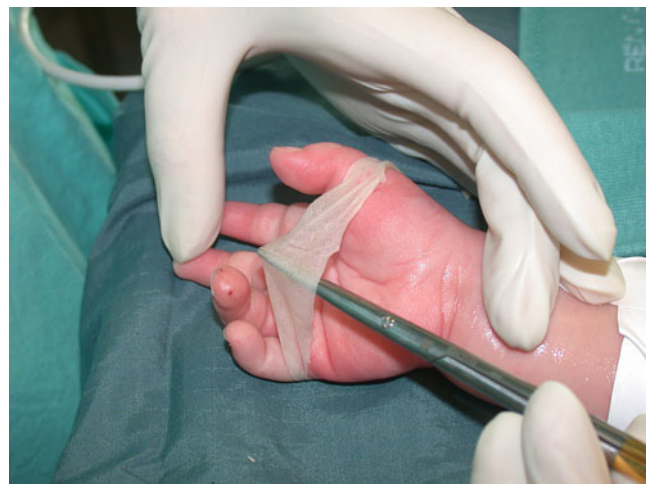
Fig. 5 New lesions appeared on day two

Since the aetiology of SSSS has been known and antibiotics have been available, systemic antibiotic therapy has become a standard treatment. In severe cases, intravenous therapy with anti-staphylococcal antibiotics is required. In patients with initial therapeutic failure using conventional antibiotics, one should not forget the possibility of methicillin-resistant S. aureus (MRSA) involvement. Topical antibiotics in generalised SSSS are often not effective, since the focus of infection is usually not known and often distant from the site of blistering. They should also be avoided due to unpredictable absorption through denuded skin. Silver sulfadiazine, which is still used in some burns units, is not recommended for SSSS because of enhanced systemic absorption through denuded skin [5]. Steroids are contraindicated on the basis of both experimental and clinical evidence [6]. In addition to the antibiotic management strategy, about which there is no controversy, there is a vast consensus that patients with