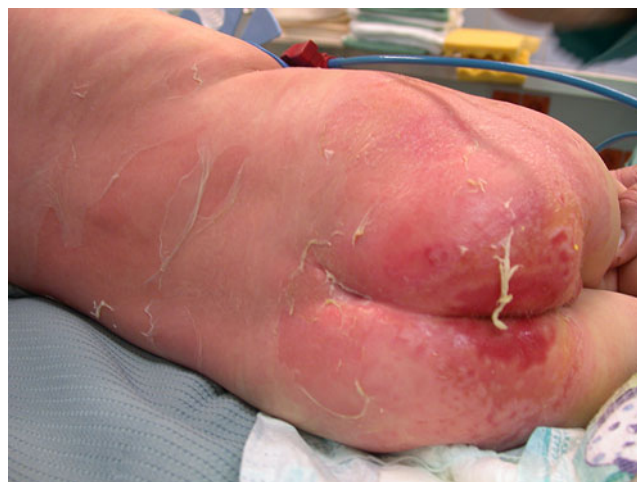
Fig. 1 Sheets of epidermal detachment on the patient's back and diaper dermatitis as presented at the first admission to the operating room