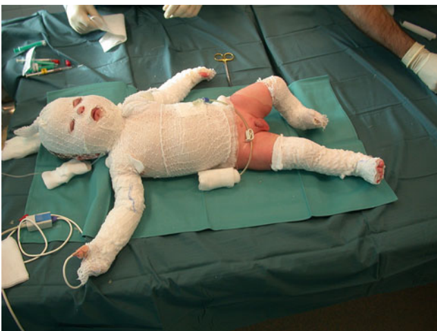
Fig. 3 Complete temporary coverage of the denuded skin with Suprathel®, a layer of paraffin and absorbent gauze secured with elastic netting

tion—confirmed the clinical diagnosis of SSSS. S. aureus strains isolated from the colonised site of the diaper dermatitis skin lesions grew methicillin-sensitive S. aureus (MSSA) producing ETB. Complicated electrolyte and fluid management in this particular case was accomplished in cooperation with paediatric nephrologists. The intravenous dosage of the antibiotic was adapted based on the impaired renal function (serum creatinine between 266 and 354 \mu\text{mol/L} , normal range 26–44 \mu\text{mol/L} ). With Suprathel® treatment as a whole-body dressing, the blister formation subsided and complete resolution occurred within five days, without scarring (Figs. 6 and 7). The patient was transferred back to the Department of Neonatology after seven days at the paediatric burns unit. The intravenous antibiotic therapy was continued for a total course of 14 days.