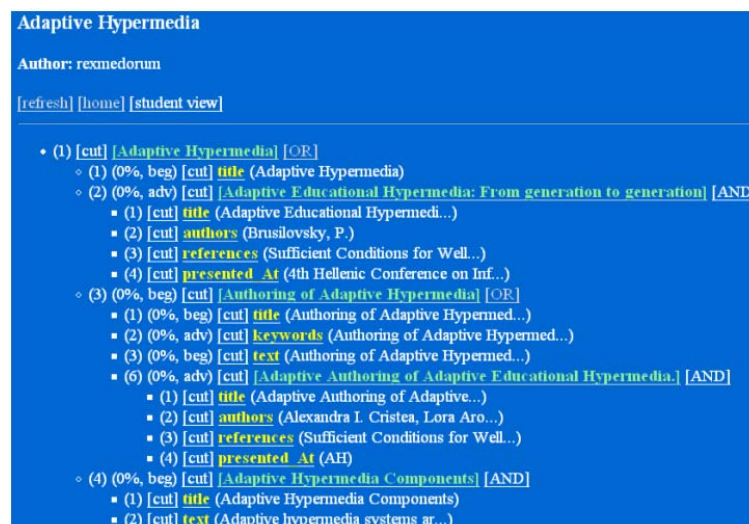
Figure 2: Adding manual metadata in a MOT lesson [Hendrix et al., 2006].

In the example, the paper called 'Adaptive Educational Hypermedia: From generation to generation' and all its relevant metadata have been added automatically during extraction to the 'Adaptive Hypermedia' domain concept, at the highest level in the hierarchy. The paper 'Adaptive Authoring of Adaptive Educational Hypermedia', a more specific one, has been added to the domain concept 'Authoring of Adaptive Hypermedia', in a lower position in the hierarchy. The author can now manually add pedagogical labels to this new material, labeling the material 'adv' for advanced learners. Finally, export of the enriched course from MOT to RDF is also possible in order to let it be exploited within external applications as well [Hendrix et al., 2006].