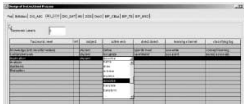
Fig. 2. DIP – a sample screen.

In order to support our model we have developed a software support tool, called DIP (Design of Instructional Process). This tool offers support to the instructional designers and educators. It provides for the settling of pre-requisites, definition of the behavior objectives that correspond to a given syllabus, analysis of the factors that influence the e-instruction process, design of an appropriate didactic strategy, and, finally, for evaluation of the characteristics/results of this process. Some capabilities of this integrated tool can provide (semi-) automated support for some parts of the traditional instructional process. The software package that implements DIP in Java 2 (from SUN), under Borland's JBuilder5, is quite simple and small sized (around 10000 source code lines). The graphical interface is simple and suggestive as it can be seen from Fig. 2.