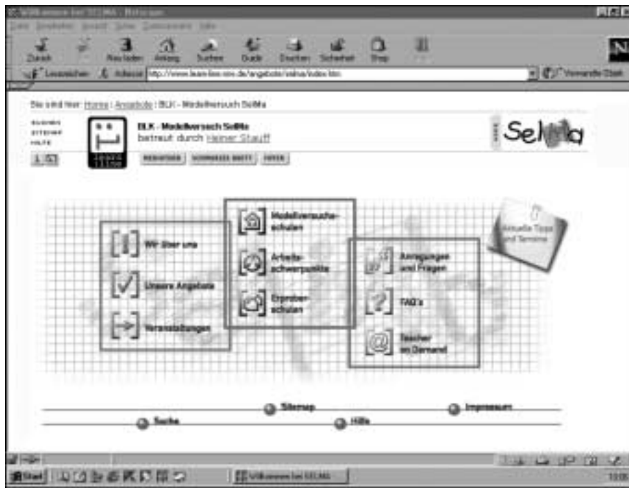
Fig. 1. Home page of the SelMa web-site.

The development of materials by the authoring schools is to take place in an “open workshop”, so that other schools can also try out them at an early stage and regularly report on their own experiences. A special role is played by ten “trial schools” which systematically try out and evaluate the materials which have been developed to see whether