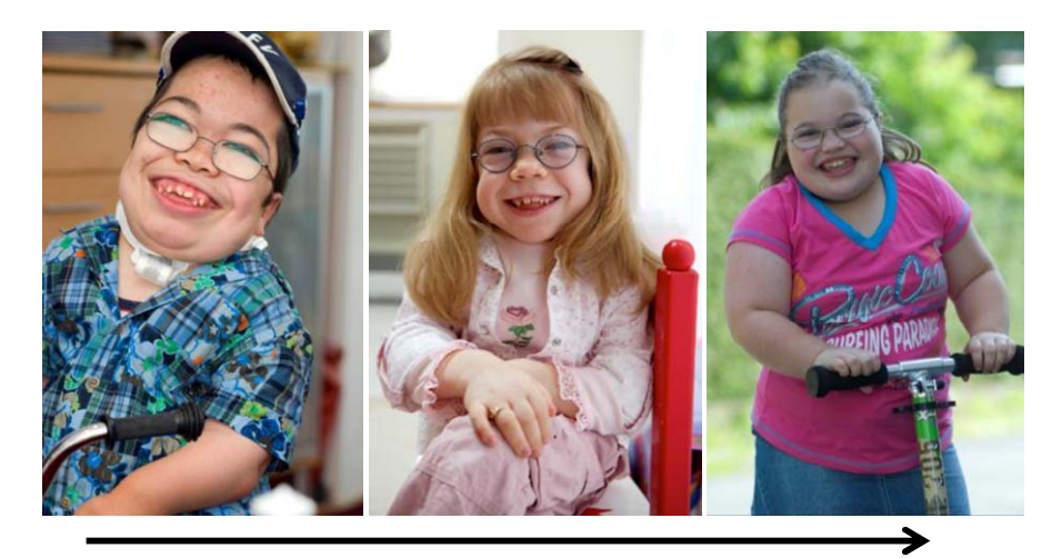
Figure 1. Patients with MPS VI of varying severity