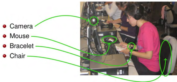
Sensors used to recognize students’ emotion and motivation.

Students with learning disabilities can benefit from adaptive instruction — for example problem sequencing, helpful pedagogical agents and meta-cognitive scaffolding — tuned specifically to their needs. For instance, one intervention might use animated learning companions that resemble students’ gender and ethnicity (e.g., Hispanic or African American) to provide advice and constructive interventions. 4 Another intervention might adjust the levels of challenge and support at key moments of students’ frustration. Such computer-based interventions have a strong potential for broad dissemination due to their general appeal, ability to personalize tutoring and limited need for resources other than a browser.