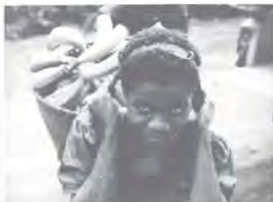
Kola Pygmy woman returning to camp carrying in her basket a bunch of plantain bananas she just bartered with the Yassa for game (photo by A. Froment).

ground, wrapped in leaves in a baton-like shape and cooked by steaming. This is the main food item for the Yassa, and, to a lesser degree, for the Kola Pygmies. The Mvae, however, have adopted a diet in which other tubers, plantain and fatty foods (oil palm, groundnuts and other seeds), together contribute as many calories as cassava. The Mvae use cassava flour (prepared from soaked cassava, dried as egg-shaped balls on a rack over the fire) to barter for game meat with the Pygmies. The Yassa use plantains to obtain meat from the Pygmies.