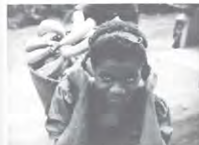
Kola Pygmy woman returning to camp carrying in her basket a bunch of plantain bananas she just bartered with the Yassa for game (photo by A. Froment).

ground, wrapped in leaves in a baton-like shape and cooked by steaming. This is the main food item for the Yassa, and, to a lesser degree, for the Kola Pygmies. The Mvae, however, have adopted a diet in which other tubers, plantain and fatty foods (oil palm, groundnuts and other seeds), together contribute as many calories as cassava. The Mvae use cassava flour (prepared from soaked cassava, dried as egg-shaped balls on a rack over the fire) to barter for game meat with the Pygmies. The Yassa use plantains to obtain meat from the Pygmies.