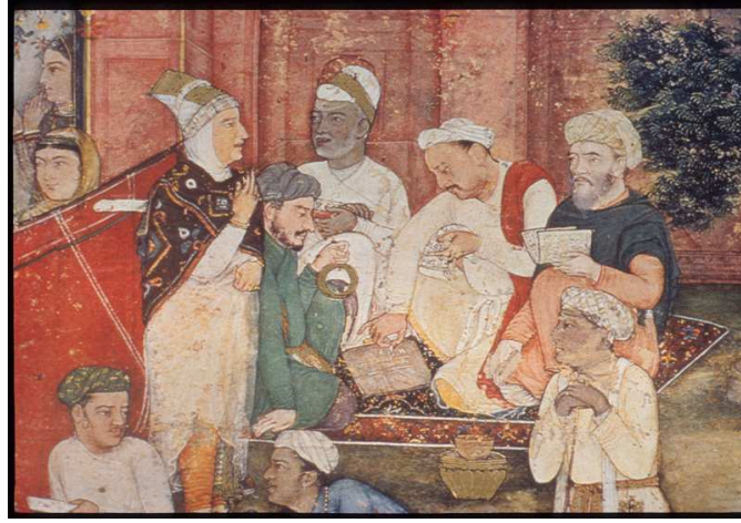
Figure 1: Kṛṣṇadaivajña 11