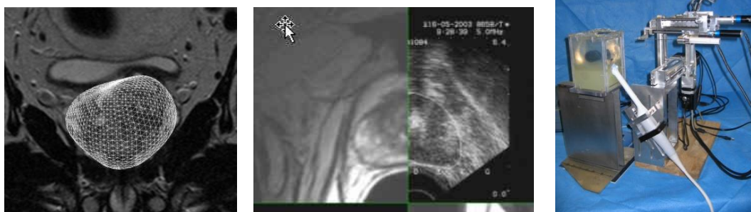
Figure 2: Prosper components

From left to right: atlas-based segmentation of MRI data, US-to-MRI registration, experimental set-up (robot, 3D US probe and deformable phantom)