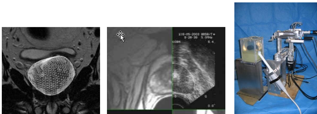
Figure 2: Prosper components

From left to right: atlas-based segmentation of MRI data, US-to-MRI registration, experimental set-up (robot, 3D US probe and deformable phantom)