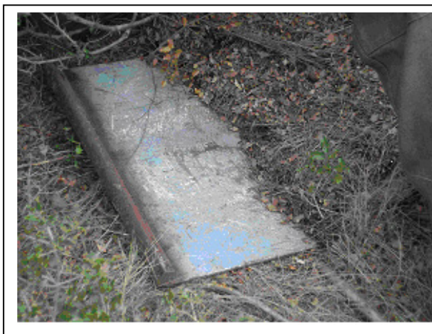
Figure 1 : Sampling of undisturbed litter

The sampling of the disturbed litter was carried out along a 20m transect placed in the middle of each 20x20m study plot. Every 2m, a sub-sample of the upper litter was collected using a calibrated iron circle of 0.2m diameter (Fig.2). For each plot, the ten sub-samples allowed the reconstruction in laboratory of one litter sample of 0.36m diameter, with a depth equal to the mean litter depth recorded in the plot