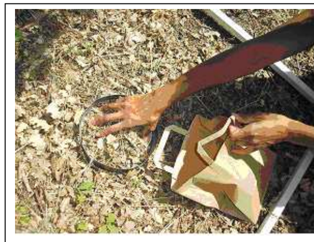
Figure 2 : Sampling of disturbed litter

The sampling was carried out according to the sampling plan used in Ganteaume et al. (2009b), on different vegetation types and fire regimes in limestone Provence (southeastern France).