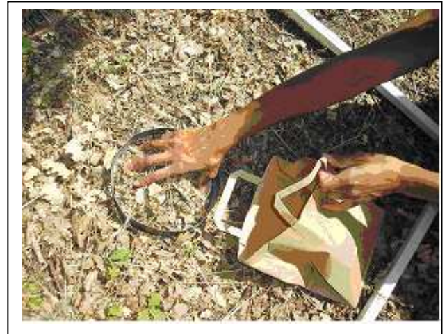
Figure 2 : Sampling of disturbed litter

The sampling was carried out according to the sampling plan used in Ganteaume et al. (2009b), on different vegetation types and fire regimes in limestone Provence (southeastern France).