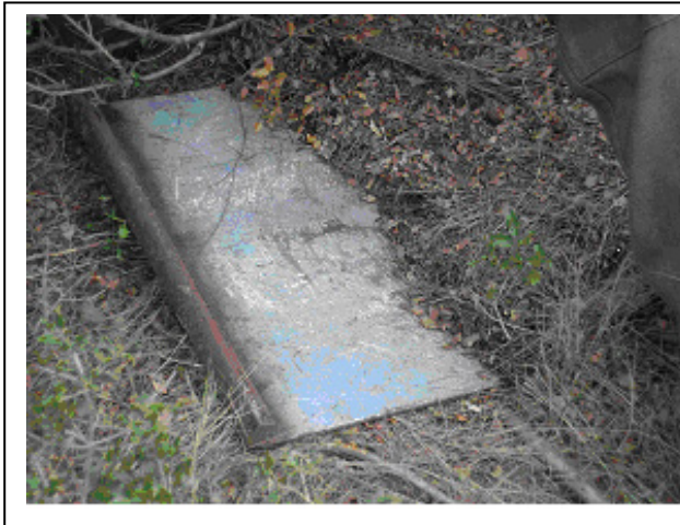
Figure 1 : Sampling of undisturbed litter

The sampling of the disturbed litter was carried out along a 20m transect placed in the middle of each 20x20m study plot. Every 2m, a sub-sample of the upper litter was collected using a calibrated iron circle of 0.2m diameter (Fig.2). For each plot, the ten sub-samples allowed the reconstruction in laboratory of one litter sample of 0.36m diameter, with a depth equal to the mean litter depth recorded in the plot