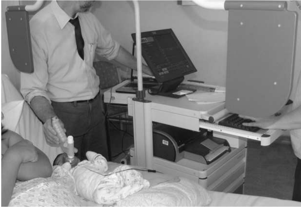
Figure 1a: Study setup, showing both FloRight vest and mask with ultrasonic flowmeter in place. The two fins of the magnetic field detector are shown suspended above the infant. 105x72mm (150 x 150 DPI)