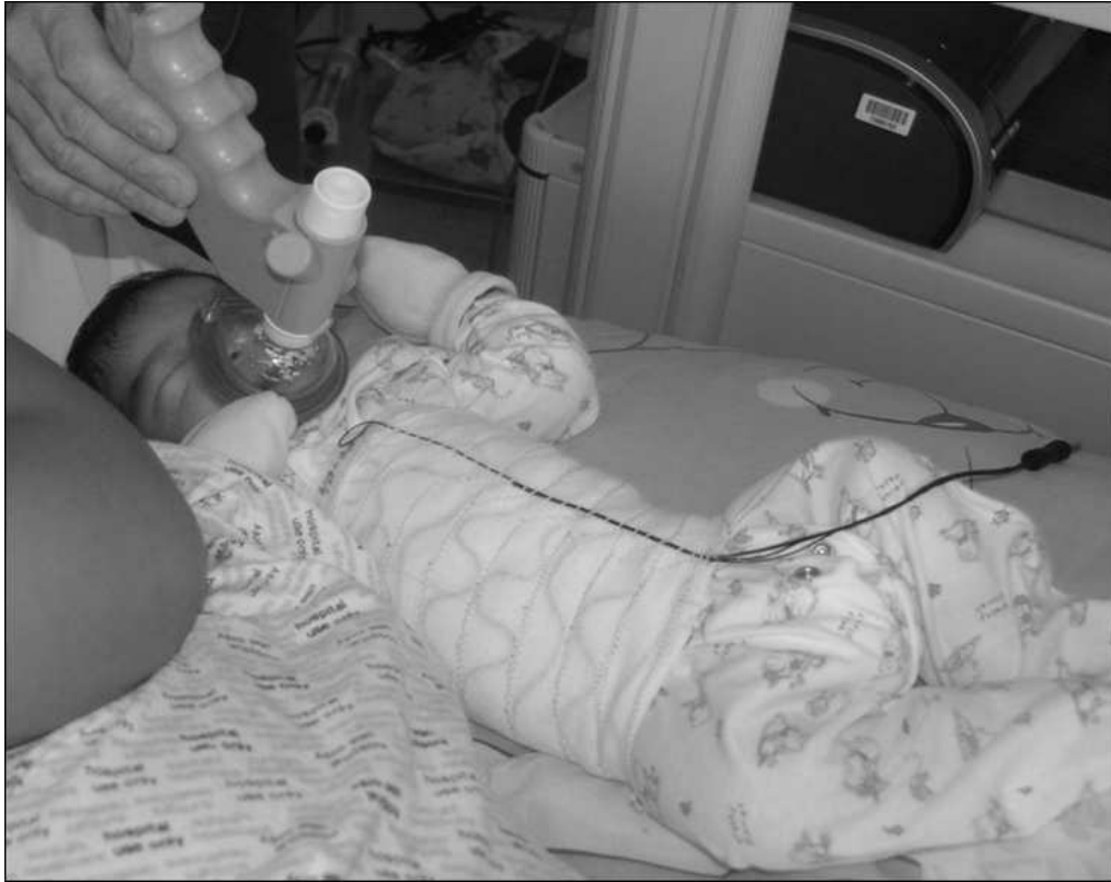
Figure 1: Study setup, showing both FloRight vest and mask with ultrasonic flowmeter in place. 194x153mm (96 x 96 DPI)

1 2 3 4 5 6 7 8 9 10 11 12 13 14 15 16 17 18 19 20 21 22 23 24 25 26 27 28 29 30 31 32 33 34 35 36 37 38 39 40 41 42 43 44 45 46 47 48 49 50 51 52 53 54 55 56 57 58 59 60