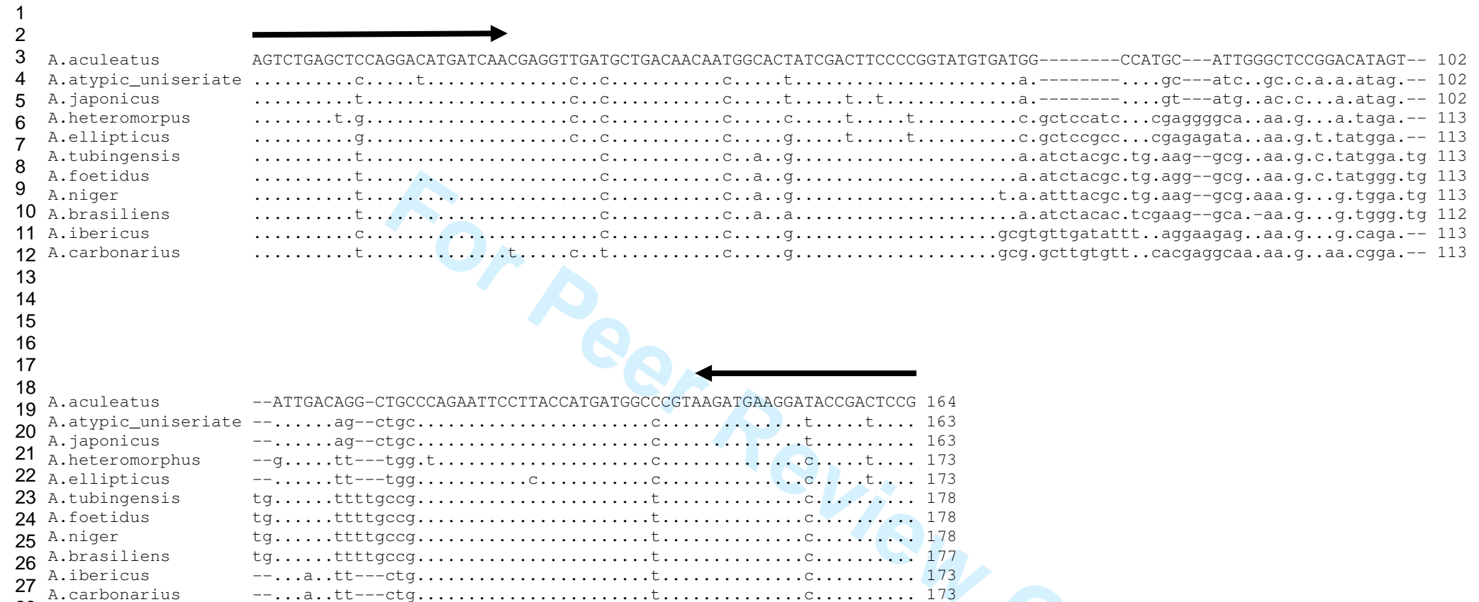
38 Fig. 1 Multiple alignment of PCR product amplified with primer SSCPCL1 and SSCPCL2, including species –specific variable region in the calmodulin gene. 39 Only nucleotide differences are shown. Arrows correspond to the annealing-regions of primers. 40 41 42 43 44 45 46 47