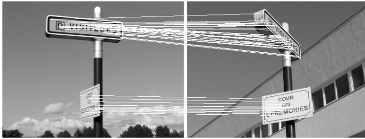
Figure 4: ASIFT: An Algorithm for Fully Affine Invariant Comparison