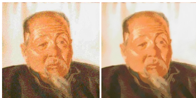
Figure 3: Non-local Means Denoising