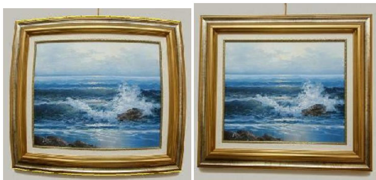
Figure 2: Algebraic Lens Distortion Model Estimation

We briefly present hereafter some of the algorithms available in IPOL. These are only seeds of what IPOL can become if the research community subscribes to this publishing model.