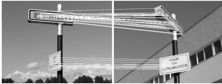
Figure 4: ASIFT: An Algorithm for Fully Affine Invariant Comparison