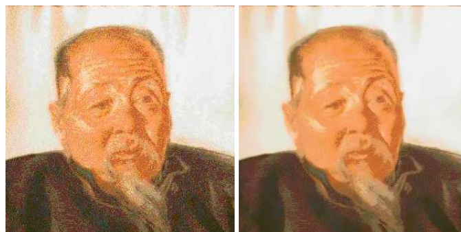
Figure 3: Non-local Means Denoising