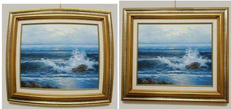
Figure 2: Algebraic Lens Distortion Model Estimation

We briefly present hereafter some of the algorithms available in IPOL. These are only seeds of what IPOL can become if the research community subscribes to this publishing model.