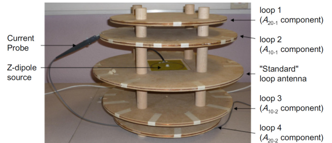
Fig. 1. Prototype Antenna (' A_{10} ', ' A_{20} ' and 'standard' loops)

CISPR16-1. All mentioned loops were built initially only in the z-direction. The complete measurement setup is surrounded by a sphere of radius ( r_M ) equal to 0.225m. The short circuited loops were proposed as sensors with a flat response within the 9 kHz - 30 MHz frequency range. Although the use of short circuited loops corresponds to a simple solution, the magnetic coupling between them imposes some constraints to the measurement and calibration methodology.